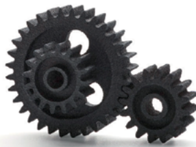
Picture taken after dye post-processing