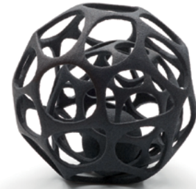
Picture taken after dye post-processing